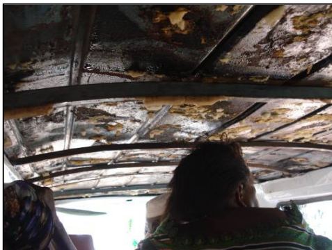
The taxi's roof

30 April: I had no more dirty clothes to use as an excuse to be in the shower, so when the internet café opened, I was the first patron. I sat there patiently enjoying the cold air until it was time for us to fetch our visas for Ghana. At the motor park, we had to wait a while for our share taxi to fill up.