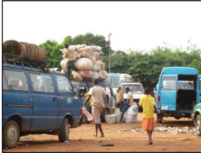
The taxi rank