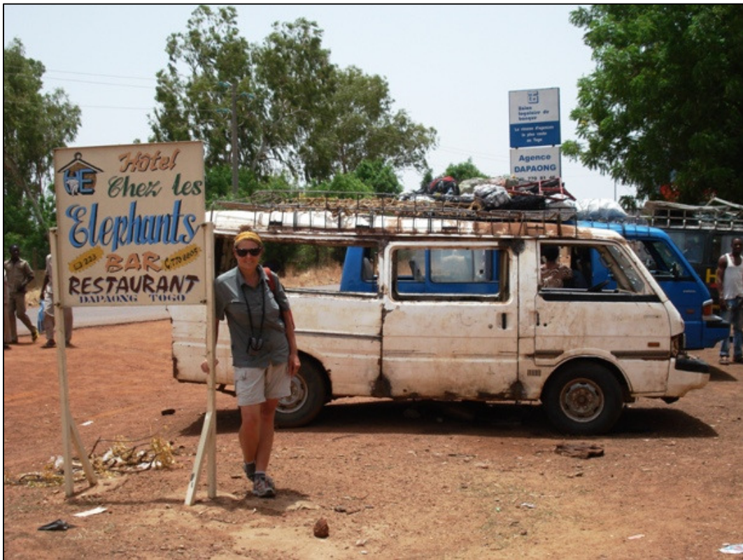
Another day, another interesting vehicle in Africa.

We finally took motorbikes across the border to Burkino Faso