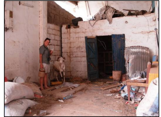
Ice bucket in hand, I made friends with the goat

Following the rest of the passengers we walked the 1.5 km to the Mauritanian border, where we discovered we should have arranged transport for our luggage. I took a motorcycle taxi back to the Mali border, hoping the guy would put one bag in front and I could hold one. The most awkward ride on a motorcycle followed. The guy put Al's backpack in the back and I had to sit on top of it, very unbalanced holding on to the petrol tank, unable to move anywhere without falling. The 1.5 km felt like 1005 km. The sun was shining directly into my face and I could see some dead animals on the desert stretch. I did not want to die in no mans land. Everyone just about cheered when I arrived, and the Mauritanian patrol waved us through, where Al was then given some tea and then we waited.