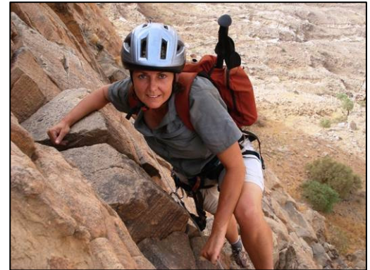
On my way to the top

I also realized that all the locals and tourists have left for a cooler place and that we were the only crazy tourists trying to climb and hike. There was no one to have our pictures taken with or to give the kola nuts, and the water we brought