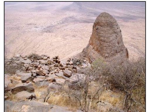
The view going down