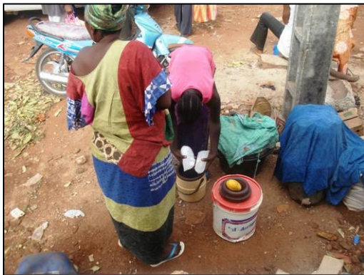
The ice lady saved my life