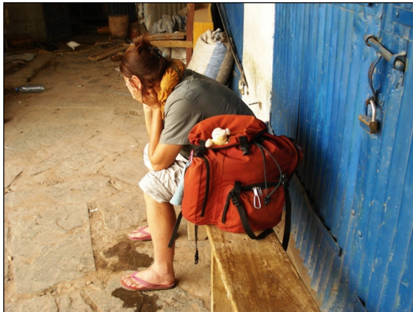
Patience, patience, patience.