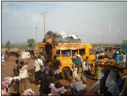
Another day in Africa

A heavenly shower at the motor park followed, and my sense of humour re-emerged. We were told the bus would leave at 14h00. Abraham, a guide from Timbuktu advised us to take Kola Nuts with, so we bought a whole bag full. It was Rasta day and everyone was in a good mood. Just as we were leaving the motor park to visit a bank, we were stopped and escorted to another bus where a fight about our luggage broke out. After a while, peace was restored and we were shown to the back seats, and the luggage was fastened behind us. At last, a nice, although loose seat. I also had a window that could open.