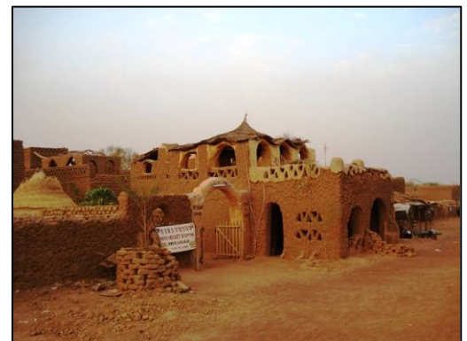
The guest house