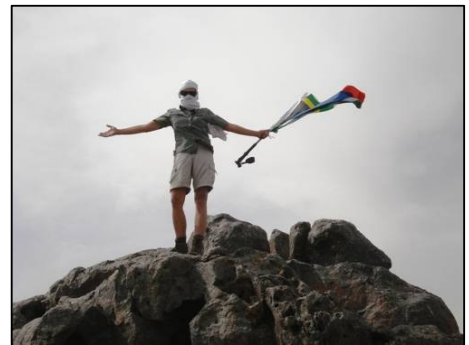
The false peak