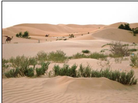
Camels in the desert

Armed with 5 kg of peanuts and a newly acquired cooler box filled with ice, I waited patiently for the bus to arrive. 6 Hours later, the only thing left in the cooler box was warm water and I crawled my way out under the peanut shell mountain, any thoughts about being a seasoned African traveler long forgotten. The short bus ride to the border was spent in silence.