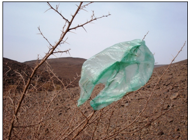
Plastic bag on top of the mountain