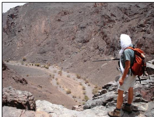
It was not so easy trying to get down

24 May. Just when I thought the 4X4 desert adventure back to Nouckchott was getting boring, a fellow passenger handed out bubblegum and our fellow passengers started chewing gum very loudly. The temperature shot to 48 degrees but when the driver was interrogated by the loud chewing passenger about paying for an air-conditioned vehicle, he just shrugged his shoulders, explaining that the air-conditioning gas was low. I opened my window, blotting out the bubblegum chewing. Raindrops started falling, followed by sand storms, forcing us to stop for short periods. Getting to the hotel was another challenge since our taxi driver didn't know where to go and couldn't speak English. Showing him the map on the