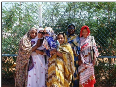
Some of the Mauritanian ladies

20 May. The day was spent recovering, trying to get an interpreter, visiting the museum and market, reading my new novel I swapped in Nouakchott, and watching endless senseless movies on cable TV. After days of suffering in the heat, we sat shivering under blankets in front of the air conditioner in the apartment. Overtiredness and the desert brought no sleep.