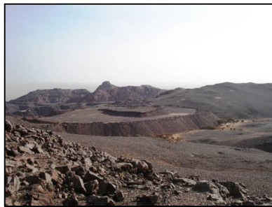
The mining on top of the mountain

Feeling strong and adventurous, we decided to go down another route.