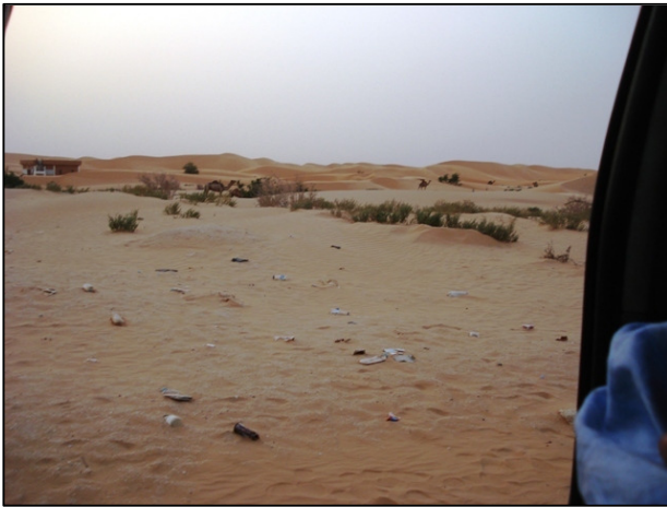
More camels and sand