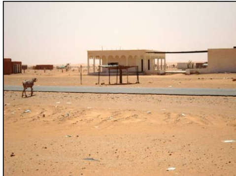
I do not do well in the desert

During the next 24 km, there were 3 police roadblocks that took 3 hours. Our senses of humour joined the plastic bags flapping in the small trees in the desert. Without hesitation, we all handed 1000 CFA over to the driver.