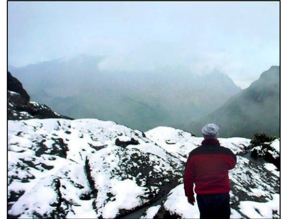
The view from Elena Hut

Day 8: While Ela recovered from the Altitude with tea and some G&T, Piers, Simon and myself boarded a bus and headed for the source of the Nile where a bungee jump and a river rafting trip on the Nile was followed by the party to end all parties.