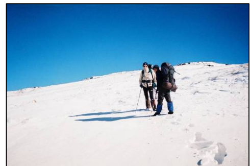
This is where we decided to turn back