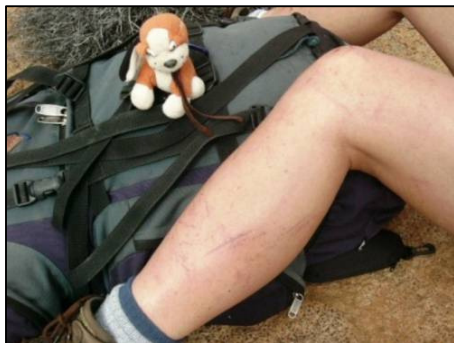
My scratched legs

8 hours later I didn't dare ask if anyone lost their sense of humour. The normal scenic route was not so normal anymore with all the rain and we went up one mountain side, then down it just to go up again 10m further. Eleven hours of boulder hopping (most of it done in the rain that never rains in Namibia) started to take its toll. I had another spectacular fall and landed with my face in the sand.