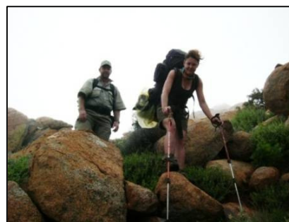
And Black Diamond wanted to know what I have done with my hiking sticks!