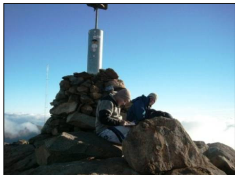
On top of Brandberg