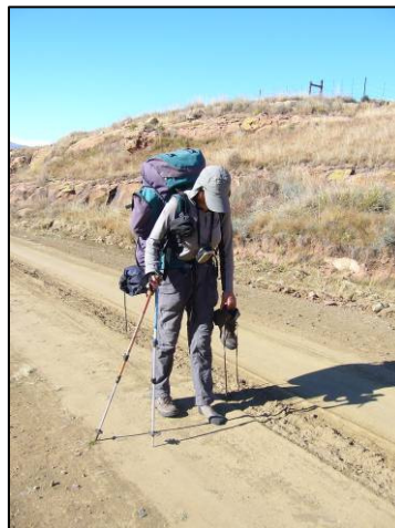
Trying to save my toes!