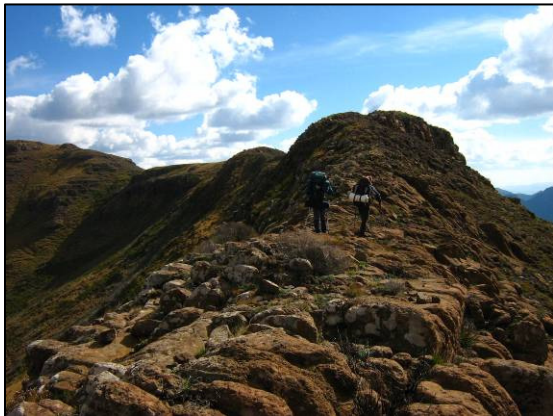
One of the highlights of the hike.