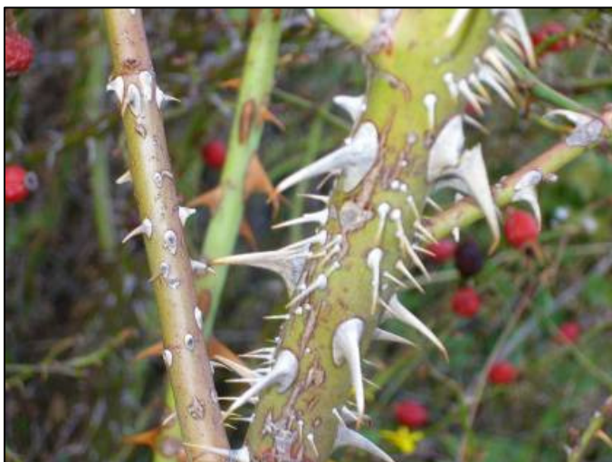
We had to struggle to get past bushes like this. Needless to say, some repairs to our clothes were necessary.

Day 2: (19 km) One can only sleep so long and we started hiking at 7h30 and headed straight for Edgehill. We were informed by everyone associated with the skyrun to turn left at a certain point but since we were adventurous/mountaineers/idiots we decided to head straight up. This would mean a 20km shortcut and how difficult can it be?