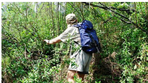
This bit required pangas

Saturday: The next morning Etienne was very excited about the dormouse he encountered the previous evening. Reading through the journal in the hut he discovered that his name was Wallace. Wallace was a true gentleman and only took some of my breakfast cereal and a bit of Etienne's. After breakfast we explored the area about 1km upstream from the famous pools. Our first attempt up the stream was barefoot and lasted about 30 minutes. Our second attempt was hiking through the bushes next to the stream. After several encounters with brambles, we decided to hike in the stream. The last stretch required pangas and we turned back reluctantly.