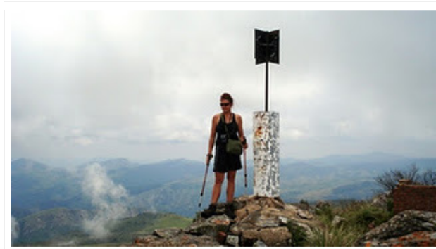
The top of Wolkberg