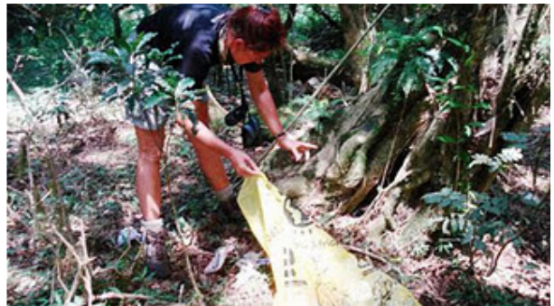
Picking up litter left behind by hikers in the forest

Tuesday: We started at 8h00 and got to Oom Paul's nose around 12h00. What a beautiful unspoiled place. The scramble down was hectic at first. Once in the Sprokieswoud we took a wrong turn and discovered a lot of litter. Needless to say, it spoiled the moment. We picked up what we could and had the rubbish bags with us the rest of the hike as a reminder how selfish people can be. It was an awesome sight watching hundred's of fireflies in this magnificent forest.