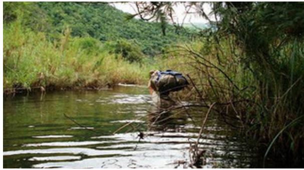
We had to abandon this route when we had to swim

This is a truly wilderness experience and I can easily spend a month here.